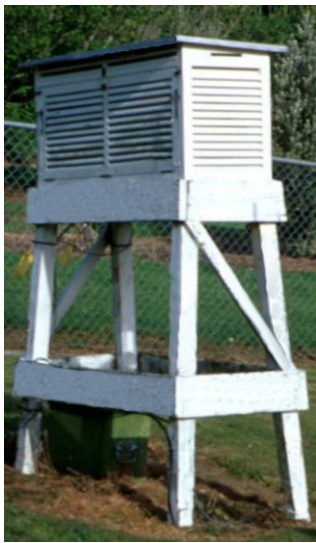
Wooden Stevenson screen