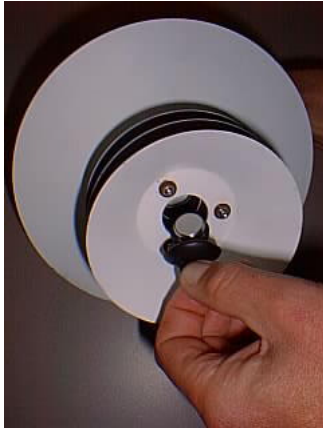
Small stacked plate screen designed for a single temperature logger.