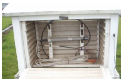
Screened and unshielded temperature sensors - grass minimum temperature probe shown below